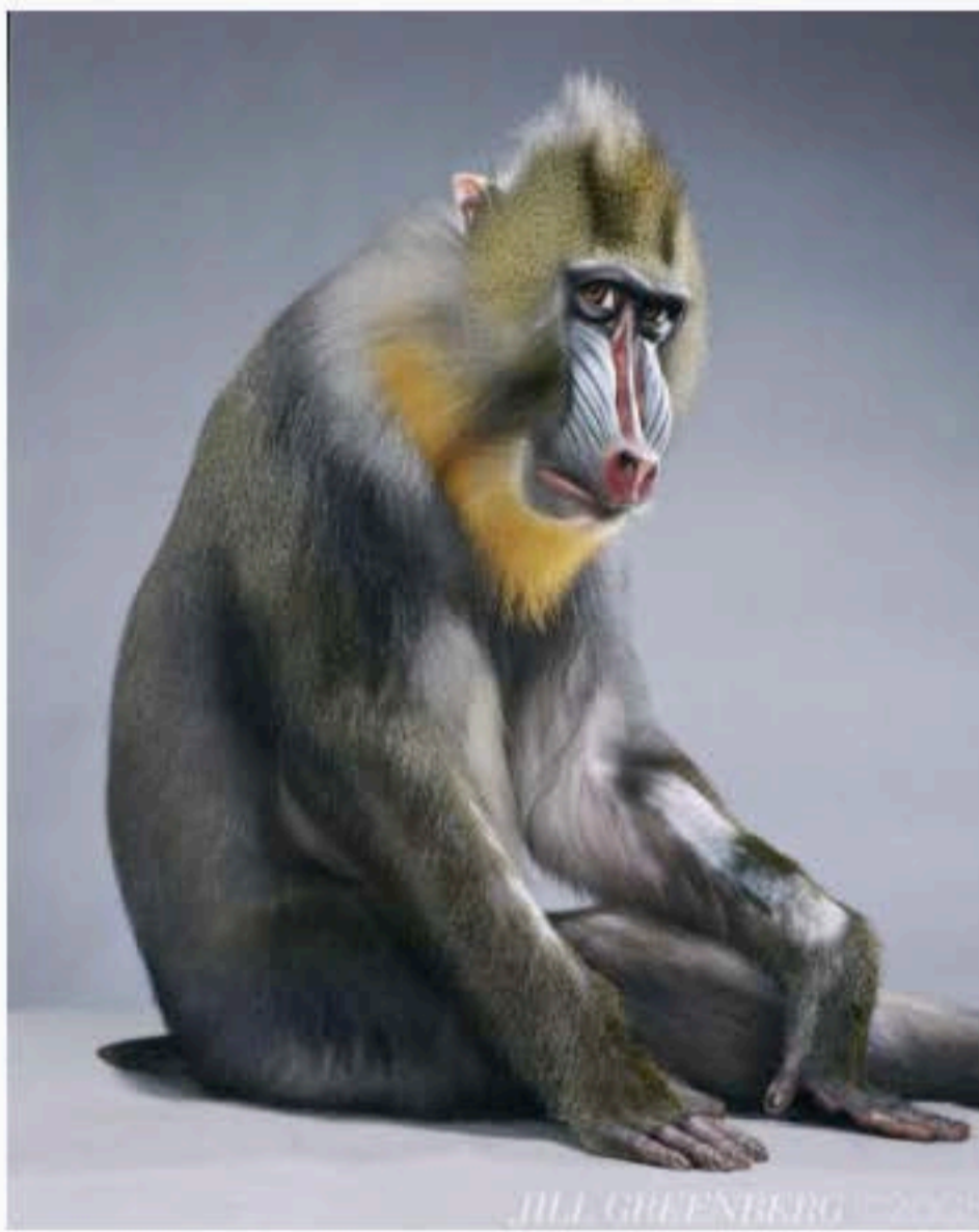
Work from the "Monkey Portraits" series by Jill Greenberg

The stencils create small, white stars, letters, and even the shape of a lightning bolt. One piece has "HAH" reflected humorously throughout it. Greenberg uses paintbrushes and plastic sheets to create the abstract, painted forms on glass, which sometimes intentionally resemble portraits. Looking even more closely at certain pieces, one can see clear reflections of the skylight and the camera—"a perfect sphere where you can really see the whole set-up," she says—offering a more open view of lighting that, in other contexts, she's kept very private and protected.