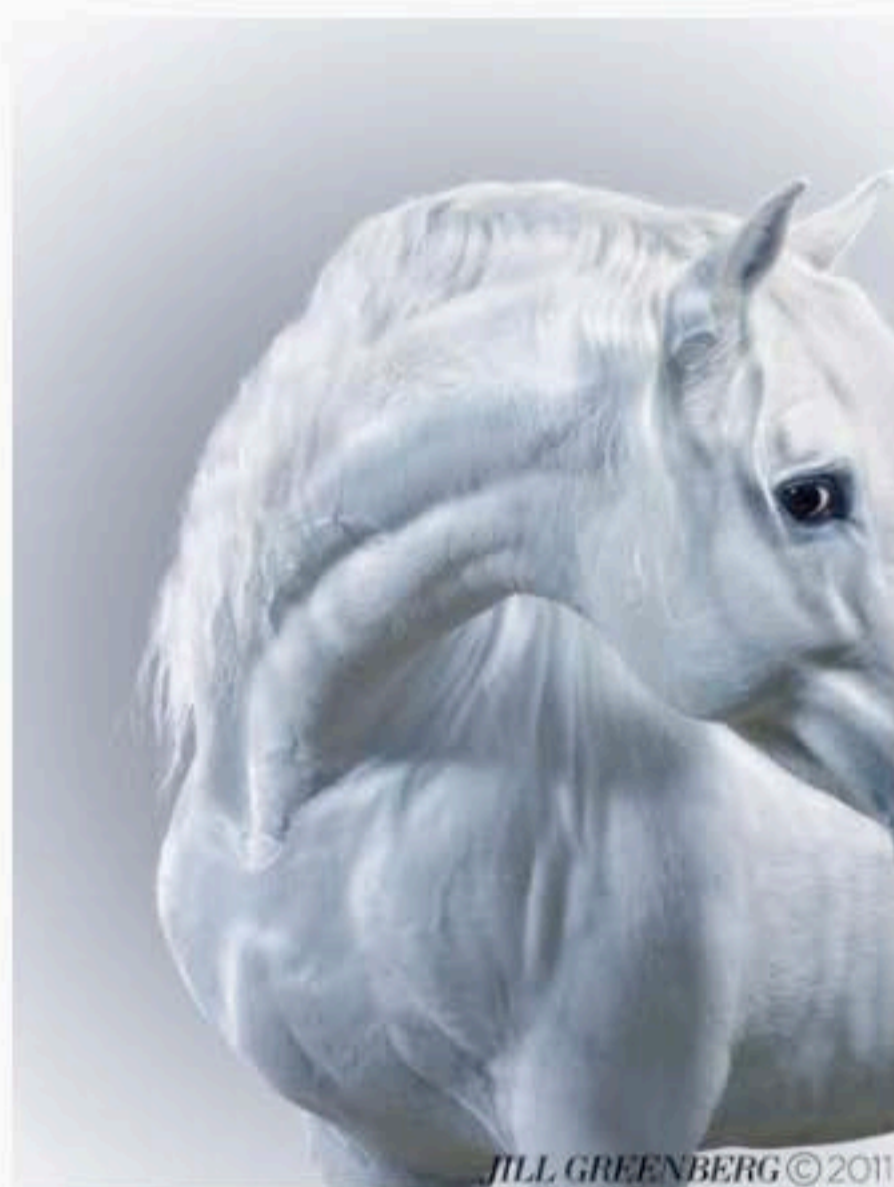
Work from the "Horses" series by Jill Greenberg

For "Glass Ceiling," Greenberg was inspired by a photo shoot with the US Olympic Synchronized Swim Team that made her think of the "set up" of being a woman. She says, "Inspired by the shoot's outtakes, I hired a local synchronized swim troupe in 2010 and directed the women with gestures as I sat at the bottom of a pool in full scuba gear with a state-of-the-art 65 megapixel back on my digital camera." Similarly, her childhood admiration of horses led to a series of photographing them and painting them in Photoshop, reflecting on their dual masculinity and femininity. She compared the horses to women after discovering "an illustration of a horse in a bridle with a woman wearing a 'scold's bridle,' which was a medieval punishment for mouthy women." Not by coincidence, Greenberg was working on both "Glass Ceiling" and "Horses" simultaneously, taking the time and physical effort to create the most compelling images possible.